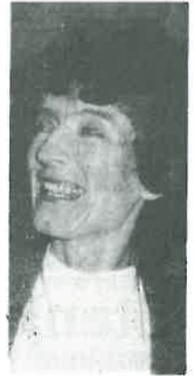
NZ Herald Nov. 3.86