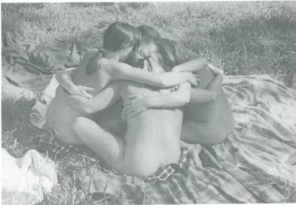
14 3. Through the fear is trust and loving.

In the past it has been assumed that babies didn't really know what was going on, that they were quite blank. Yet a few years ago, when people started going into very deep workouts in groups, I started seeing this birth process happening on the floor in front of me. And somehow the first experience of actually living on your own has been impressed on every one of your minds. And it is surprising how clear a picture some people get when they go through their rebirth process. They go through all the feelings which were there at the time.