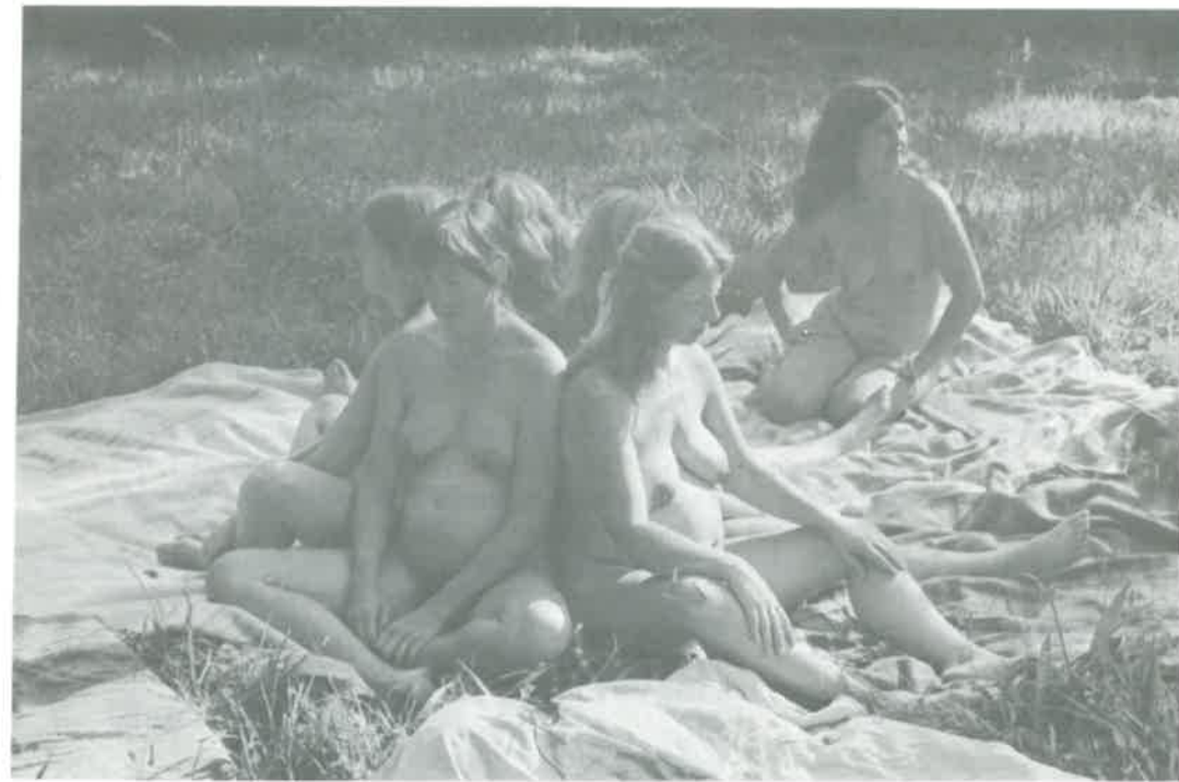
1. Back to back. Experience your fears.

We need the stimulation of people and we don't get it in most of society because everybody is doing the same thing, closing down. Here we allow the children to have this sort of stimulation. We allow them to experience things. For example, allowing all the children, even the young ones, to watch the births, has taken away all the stupid romantic mystery of birth. We're saying here it is. This is a natural process. Watch and be part of it. And so when they go to school they're going to one of the small group of children who really know what happens. They know the baby wasn't delivered by a stork. They know how babies are conceived too. They're included in these very deep and very intimate experiences. They haven't got all the mystery to get through. They're having it all cleared away. But the greater mystery is still there, that of experiencing all these things within ourselves.