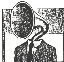
ABERPHONIC SECRET MUSIC SATURDAYS. 9pm - 9.30 pm