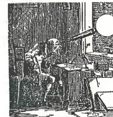
The Final Frontier Saturday at 10.00